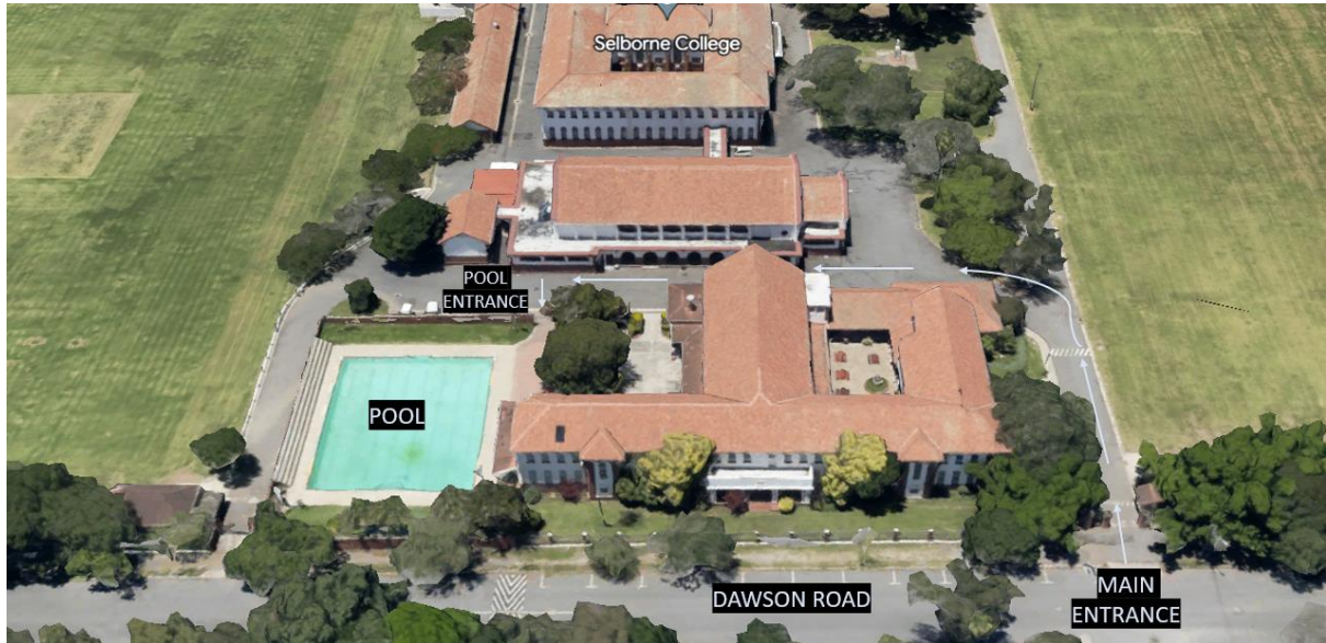
MAP OF THE VENUE – REF: GOOGLE EARTH (slightly outdated) (Parking available off premises – road side parking)